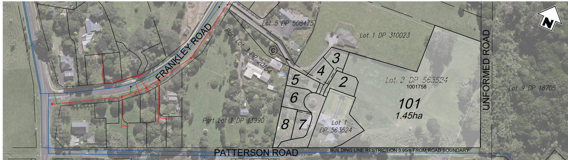
OVERALL PLAN SCALE 1:2000

Existing Easements 12213387.3-5 are to be surrendered